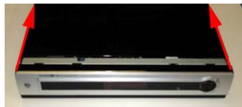
Figure 3 (above) Front View