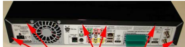
Figure 2 (above) Back View

Once the six screws are removed, remove the lid. Place your palms on the top side edges of the TiVo, toward the back and push toward the back of the TiVo (this occasionally requires a bit of force). The cover should slide back and then up. Remove the cover from the TiVo.