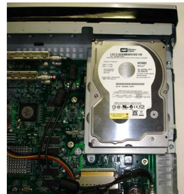
Figure 5 (above)

Using your Torx T10 L-key, unscrew and remove the four bracket screws that connect the hard drive bracket to the lower bracket (part of the bottom of the unit). Set these bracket screws aside. You will be using them again later. See Figure 4.